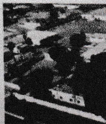
Agadir Solar Solutions in Morocco.