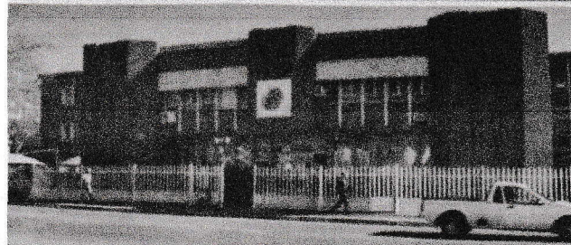
The municipality's main building in Houta Street in Carletonville will be empty since the delegation goes to Morocco. Even the staff there would be someone to stand in for the mayor if she is not around, will be flying off to the North African country.

Best way your eyes Brave teenager escapes robbers - P3 Fochville se skopboksers na Hongarye - bl. 8